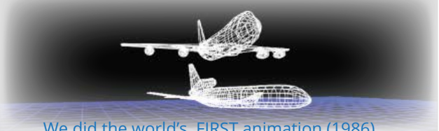
We did the world's FIRST animation (1986)